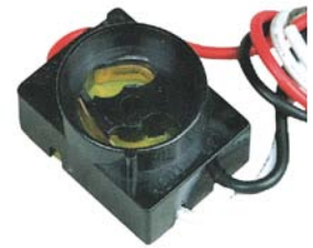
LLAS20 Electronic Photo Control Rated voltage 230V~ Load 300W