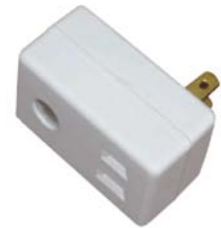
LLAS24 Electronic Photo Control Rated voltage 110/240V~ Load 150W