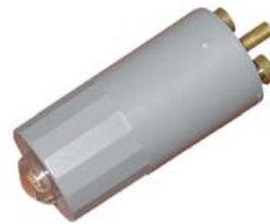
LLAS19 Electronic Photo Control Rated voltage 105-240V~ Load 150W