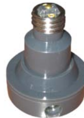
LLAS23 Electronic Photo Control Rated voltage 110V/240V~ Load 300W