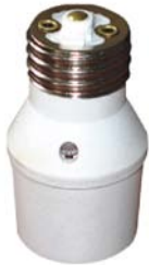
LLAS21 Electronic Photo Control Rated voltage 110V/240V~ Load 150W