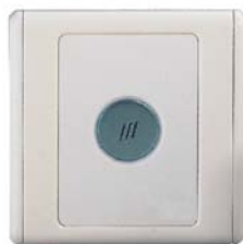
LLAS30 Electronic Photo Control Sound&Infrared Motion Detector Rated voltage: 110V-240V Size: 86x86mm