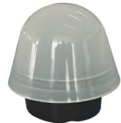
LLAS33 Electronic Photo Control Rated voltage: 110V/240V/~ Rated current: 3A, 6A, 10A,