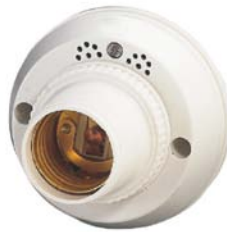
LLAS16 Electronic Photo Control Rated voltage 110-240V~ Load 150W