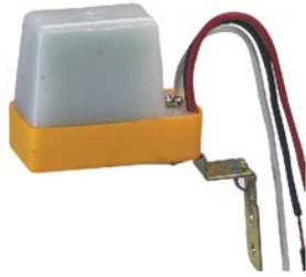
LLAS9 Electronic Photo Control Rated voltage 110-240V~ Load 1000-1500W