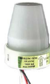
LLAS32 Thermal photo control Rated voltage: 110V/240V/~ Rated current: 3A, 6A, 10A,