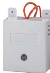
LLAS31 Electronic Photo Control Infrared Motion Detector Rated voltage: 110V-240V