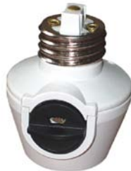
LLAS22 Electronic Photo Control Rated voltage 110/240V~ Load 150W